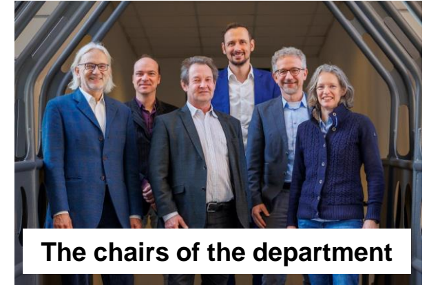
The chairs of the department

The Department of Polymer Engineering and Science covers all aspects of polymer research from chemistry of polymers, polymer physics and testing , processing and design . Specifically, actual trends like biopolymers, smart production and additive manufacturing, lightweight design, durability and recycling of polymers is covered in Education and Research .